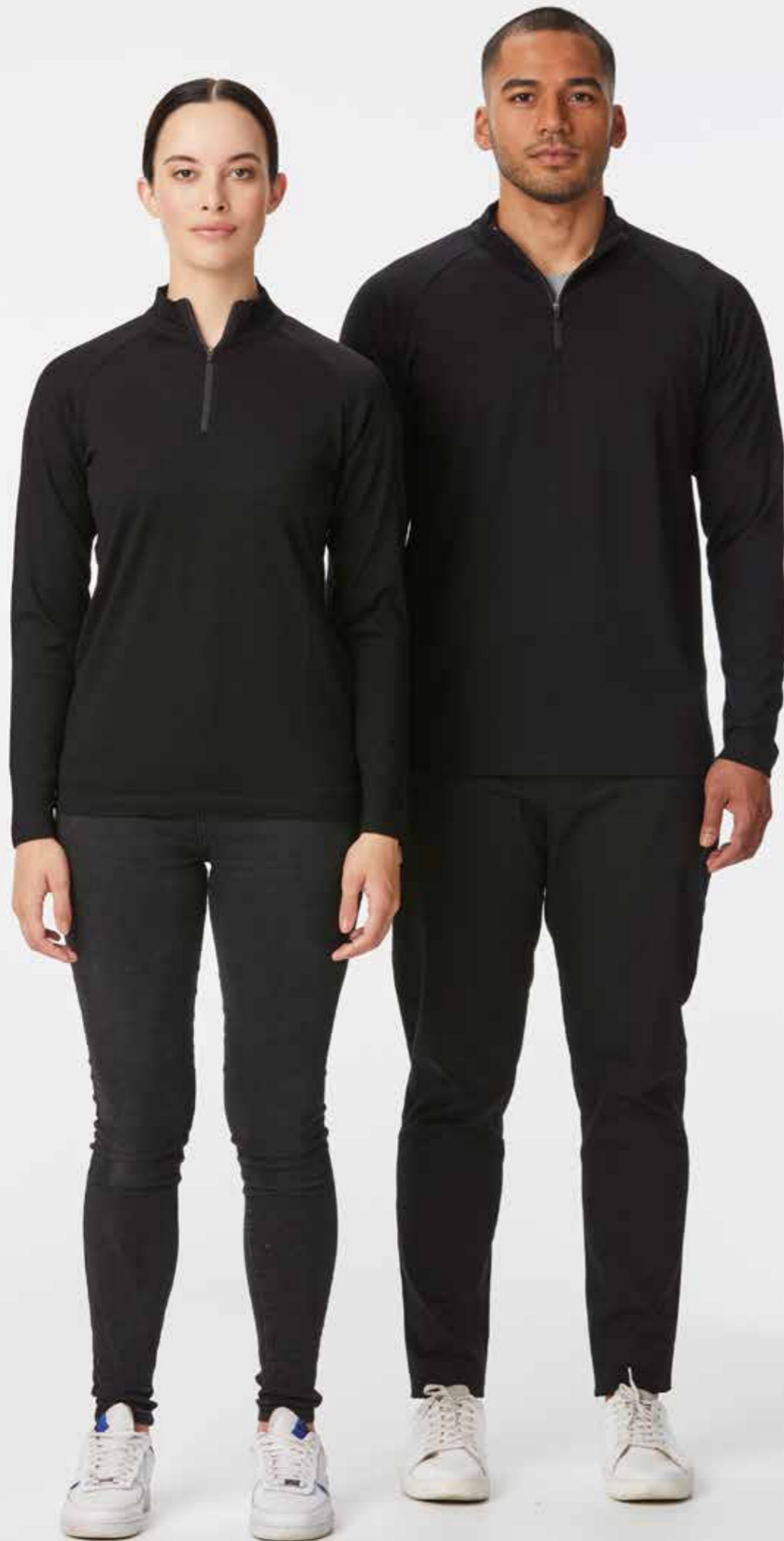
FEMALE: Black MALE: Black